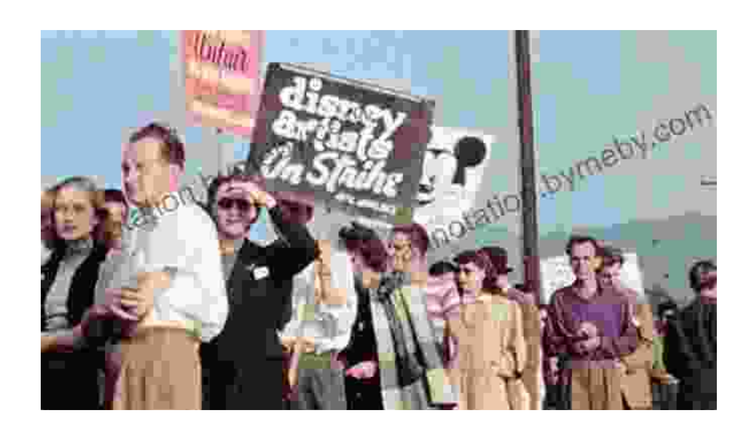
Praise for Talking Disney With The Artists Who Knew Him

Immerse yourself in the untold stories and behind-the-scenes secrets that shaped the Disney empire. Free Download your copy of Talking Disney With The Artists Who Knew Him today and experience the magic of Disney like never before!