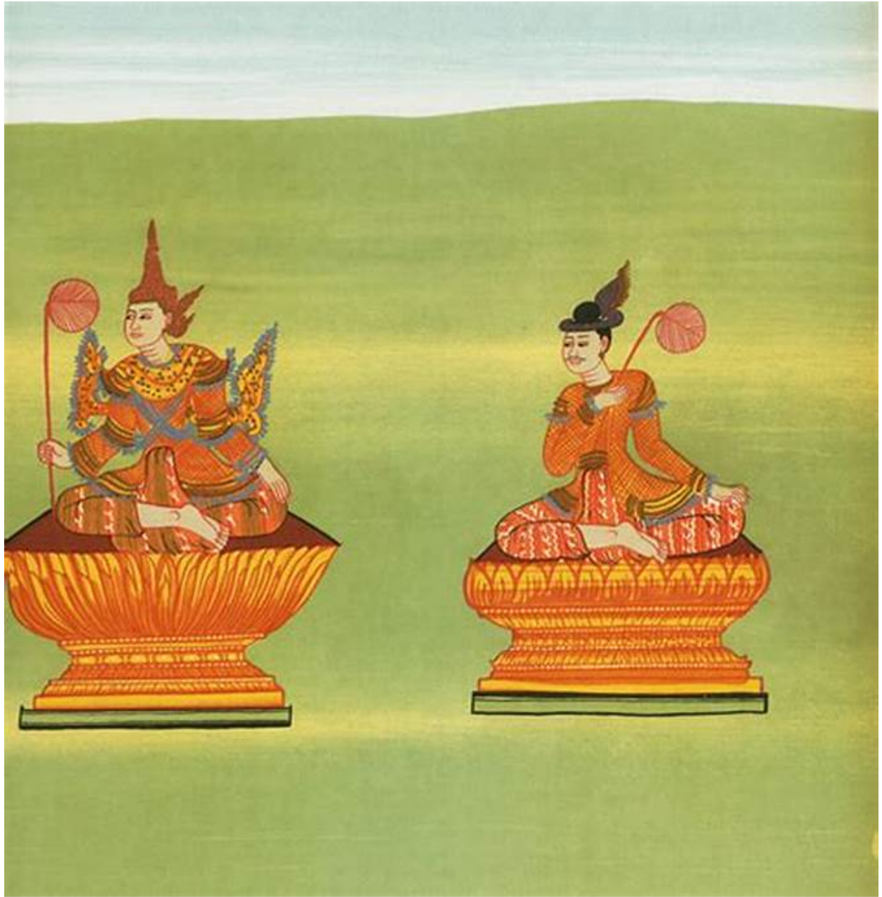
The Lord of Sipán