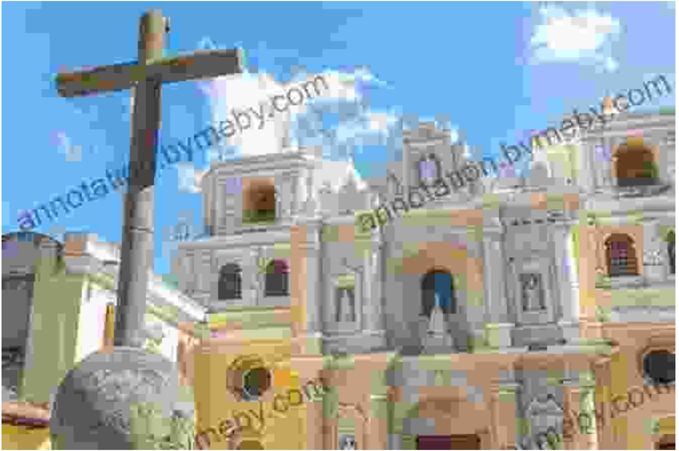
Stroll through the cobblestone streets of Antigua, a UNESCO World Heritage Site.