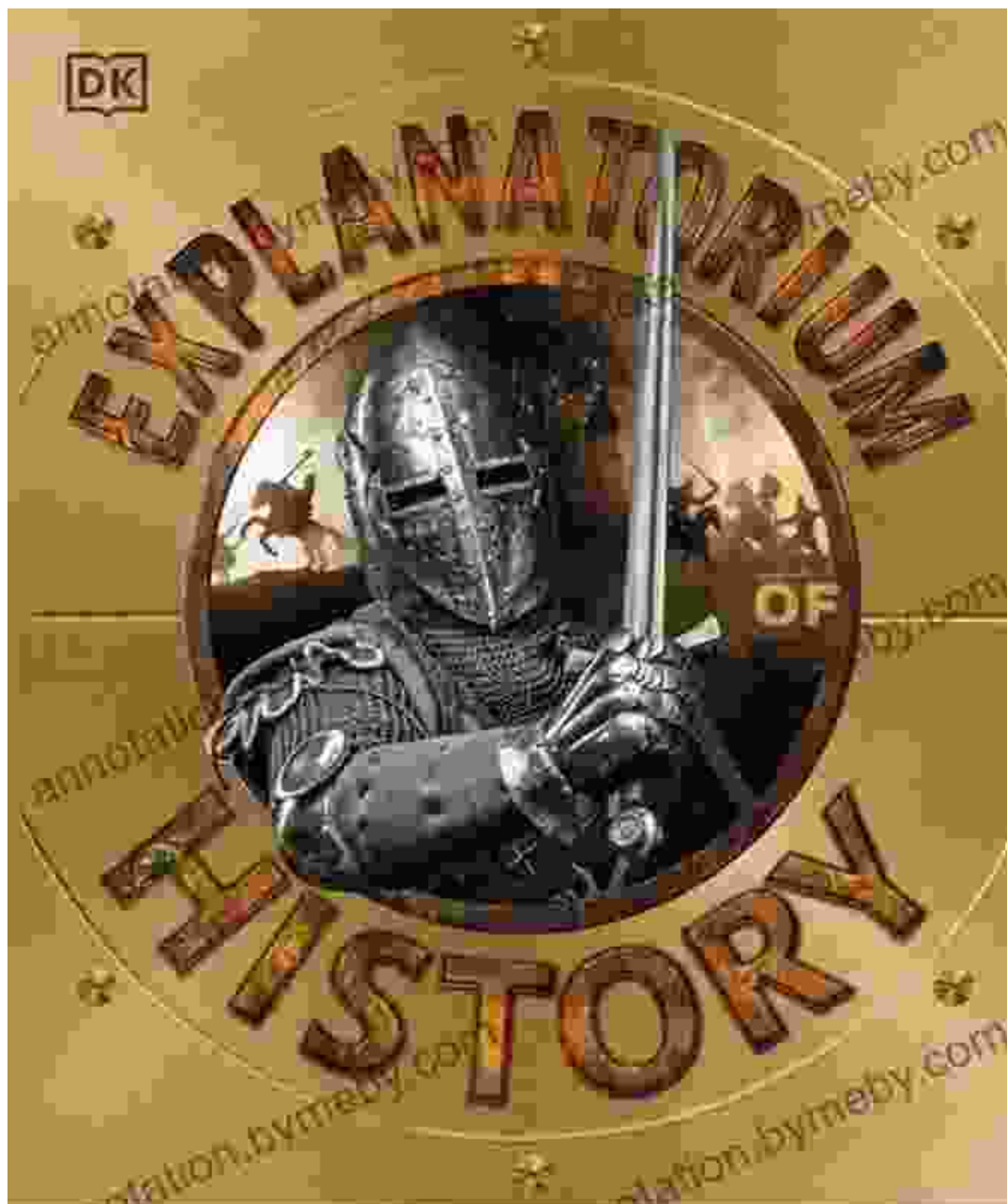
Explanatorium of History by DK

Embark on an extraordinary journey through time and witness history unfold before your very eyes!